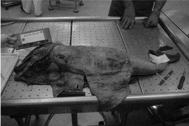
Lateral view- gular focal coloration

1). Carcass: Open-post mortem decomposition