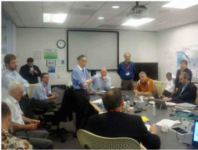
U.S. Energy Secretary Steven Chu and National Laboratory scientists review options for the "top kill" attempt with BP officials.

Washington D.C. — At the request of President Obama, U.S. Energy Secretary Steven Chu has been helping oversee BP's "top kill" efforts from the BP Command Center in Houston. Below are two photographs from this week.