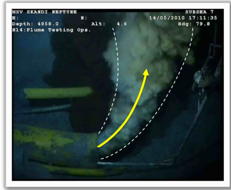
End of Animation