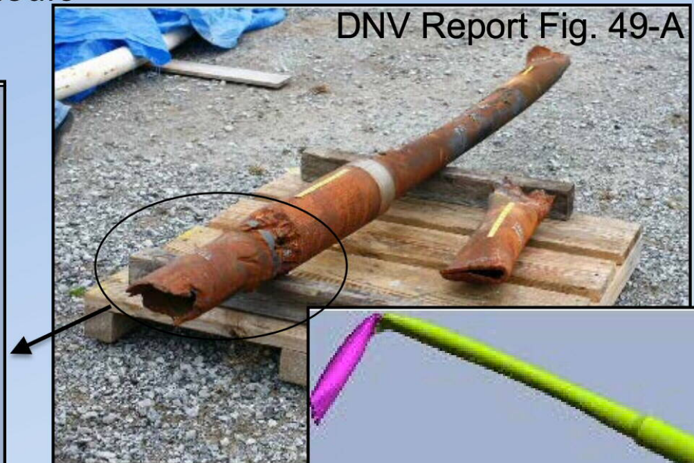
DNV Report Fig. 49-A