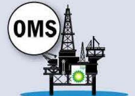
Thunderhorse PDQ (owned by BP)