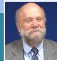
US Expert Quivik