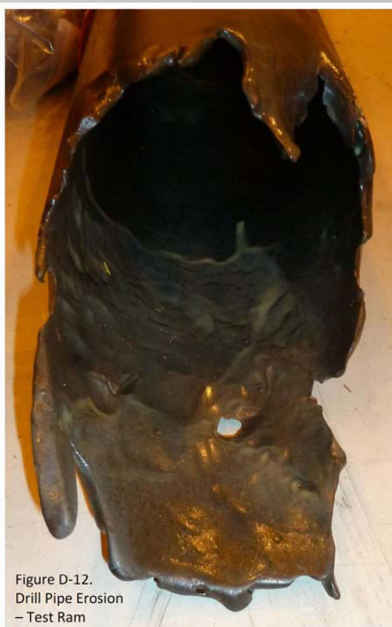
Figure D-12. Drill Pipe Erosion – Test Ram