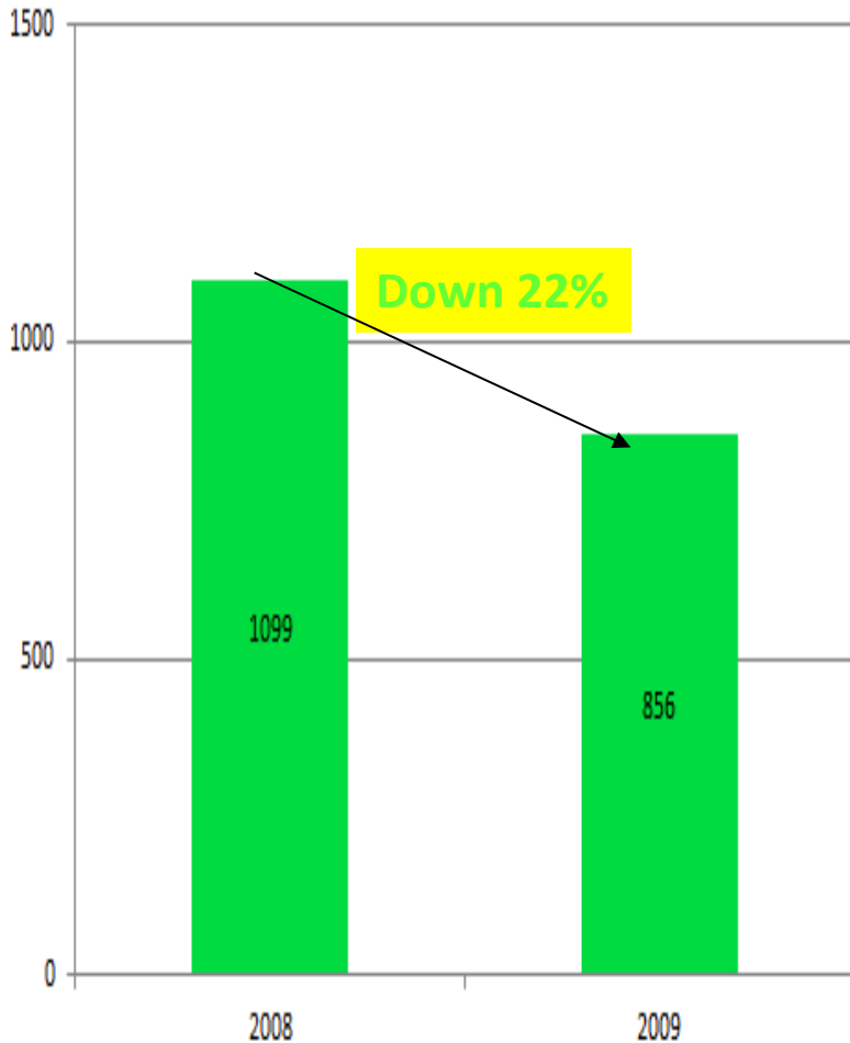
Cash Costs, $1,000